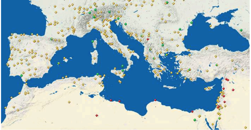
Figure 1. Mediterranean UNESCO Cultural and Natural Heritage (UNESCO WHC, 2017). Sites at risk or threatened are shown in red colour.

tion, and the social impacts of sites; the second one, which is close to the idea of Sustainable Development, concerns the protection policies and the future enjoyment of the assets, in their present-day conditions.