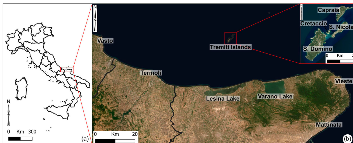
Figure 1. (a) Location map of the study area in Southern Italy; (b) satellite image of Gargano promontory's coast (ESRI Satellite, World Imagery). In the red zoomed box, there is the orthophoto image of the Tremeti Islands (Puglia Region, http://www.sit.puglia.it ).