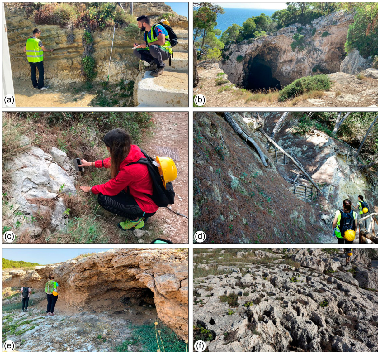
Figure 2. Photo documentation of geomorphological field activities: (a) detail of field work at I Pagliai; (b) karst depression on the calcareous bedrock; (c) detail of geomechanical investigations at Cala degli Inglesi; (d) V-shaped gully interrupted by artificial wooden barriers, at Cala Matano; (e) emerged karst cave at Cala della Tramontana; (f) dolomitic limestone outcropping at Punta Secca.

Gullies are mainly due to the running waters and show a NE-SW to N-S direction. Coastal landforms are represented by cliffs consisting of steep slopes (up to 15 m high) developed especially in the western sector of the field survey area. The main geomorphological hazard of the area is the high fracturation of the calcareous bedrock, largely affected by an NW-SE tectonic element and several horizontal caves (Figure 2(b)) especially in the western sectors under the lighthouse of the island. For these reasons, the realization of a new hotel in the lighthouse's site is not allowed because of the geomorphological setting of the westernmost sector of San Domino island affected by instability and retreat of the vertical marine cliffs between Punta Secca and Grotta del Bue Marino.