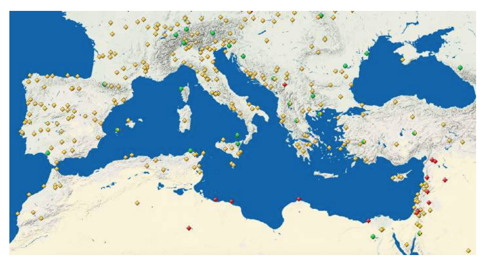
Figure 1. Mediterranean UNESCO Cultural and Natural Heritage (UNESCO WHC, 2017). Sites at risk or threatened are shown in red colour.

tion, and the social impacts of sites; the second one, which is close to the idea of Sustainable Development, concerns the protection policies and the future enjoyment of the assets, in their present-day conditions.