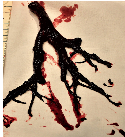
Figure 3 Detail of the mold clot involving the segmental and subsegmentary bronchial branches.

However, few cases of EBUS-TBNA related massive haemorrhage have been reported in literature. In a case