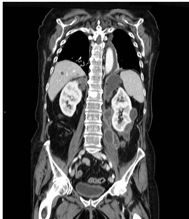
Figure 2 By continuing the crizotinib treatment the confluent cystic formations extend from the kidneys to the diaphragm, to perirenal spaces, to the left iliopsoas muscle; two hepatic cysts appear.

The mechanisms underlying simple and complex cystic renal lesions during the crizotinib treatment are still