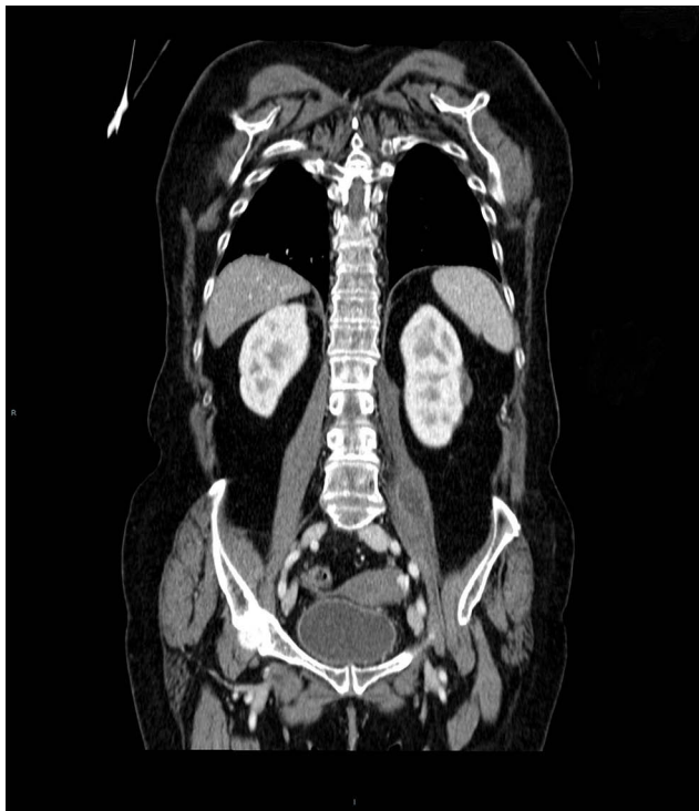
Figure 3 The cysts decreased in size and number by switching therapy to alectinib.

unknown. Crizotinib has been originally studied as an inhibitor of c-MET and subsequently tested for ALK and ROS1 -rearranged NSCLCs. 3