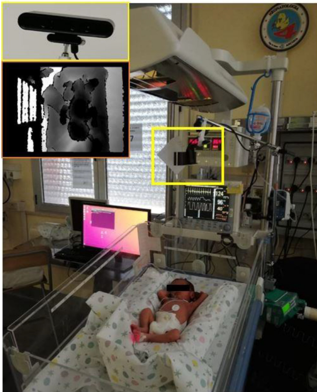
Fig. 1. Depth-image acquisition setup. The depth camera (yellow boxes) is positioned at 40cm over the infant's crib and does not hinder health-operator movements. An example of the acquired depth frame is showed on the top left corner (orange box).