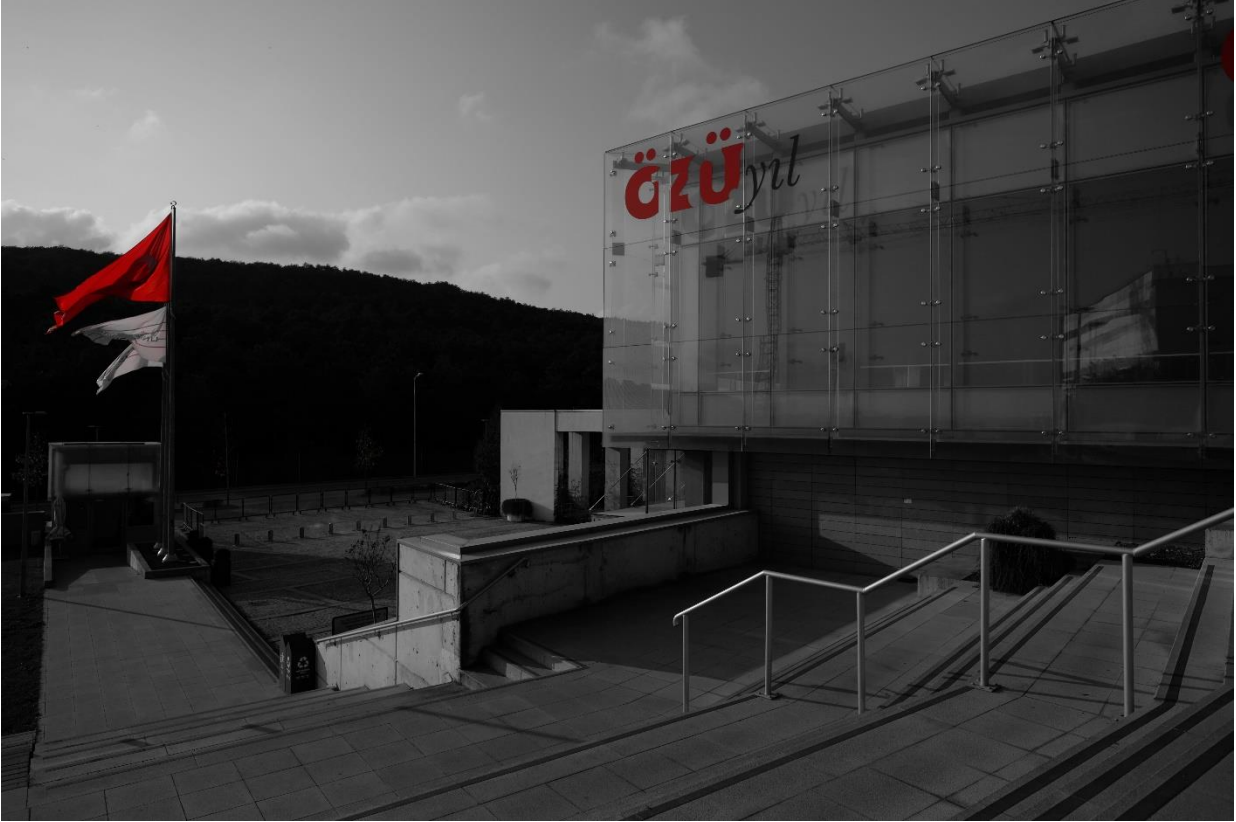
Fig. 3 Conference venue: Özyeğin University, Istanbul