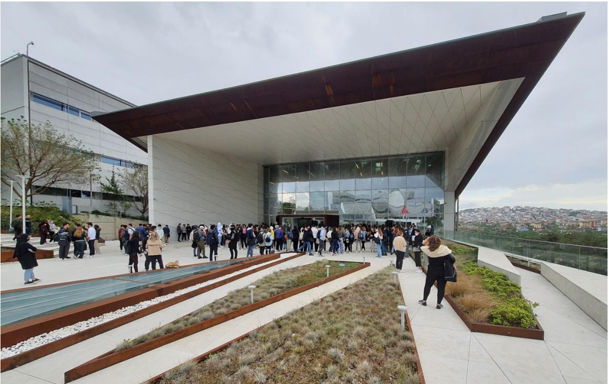
Fig. 4 Conference venue: Özyeğin University, Faculty of Architecture and Design, Istanbul