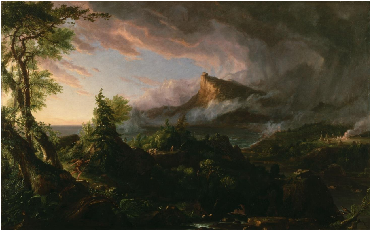
Fig. 1 Thomas Cole, The Course of Empire. The Savage State , oil on canvas, 1833, New York Historical Society, New York City, NY, US.