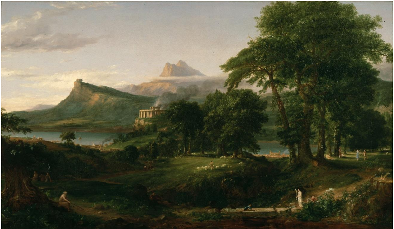
Fig. 2 Thomas Cole, The Course of Empire. The Arcadian or Pastoral State , oil on canvas, 1834, New York Historical Society, New York City, NY, US.