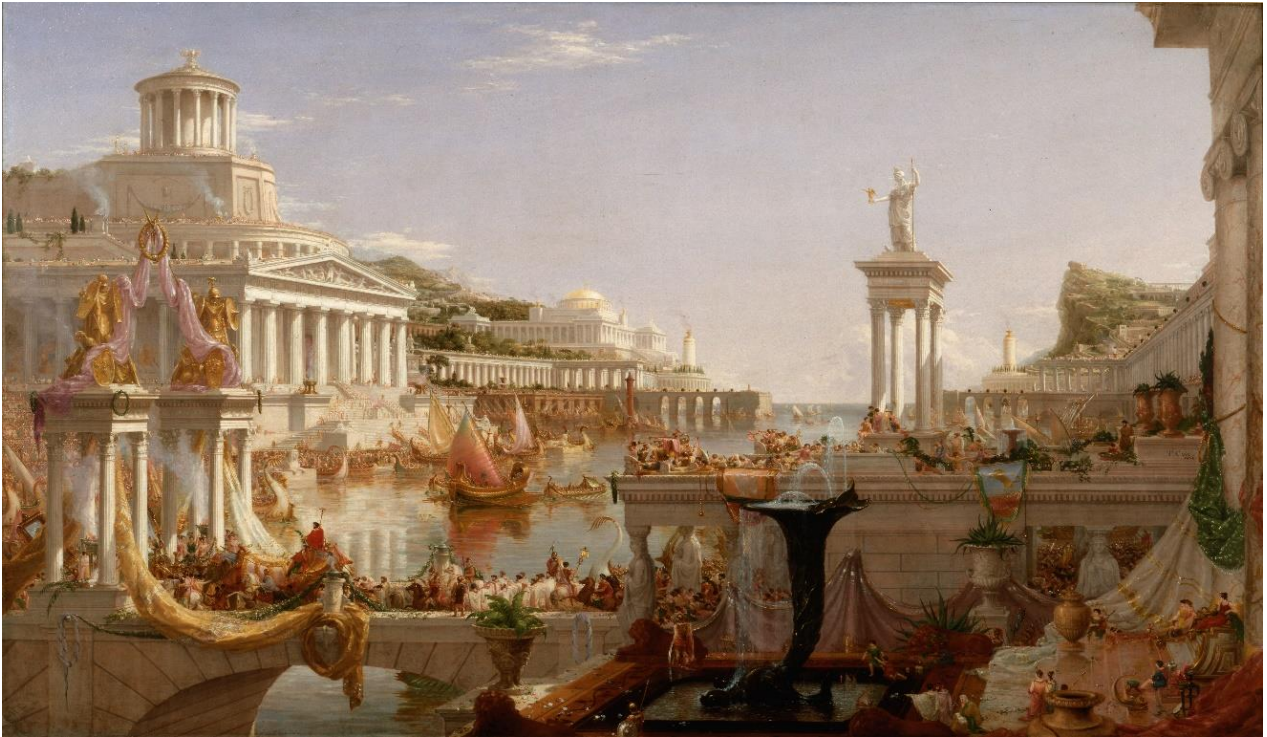
Fig. 3 Thomas Cole, The Course of Empire. The Consummation of Empire , oil on canvas, 1836, New York Historical Society, New York City, NY, US.