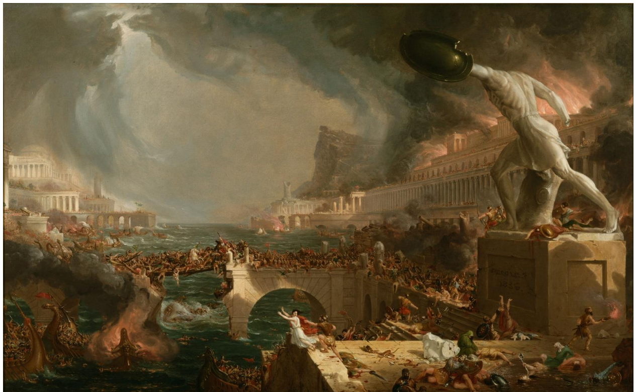
Fig. 4 Thomas Cole, The Course of Empire. Destruction , oil on canvas, 1836, New York Historical Society, New York City, NY, US.