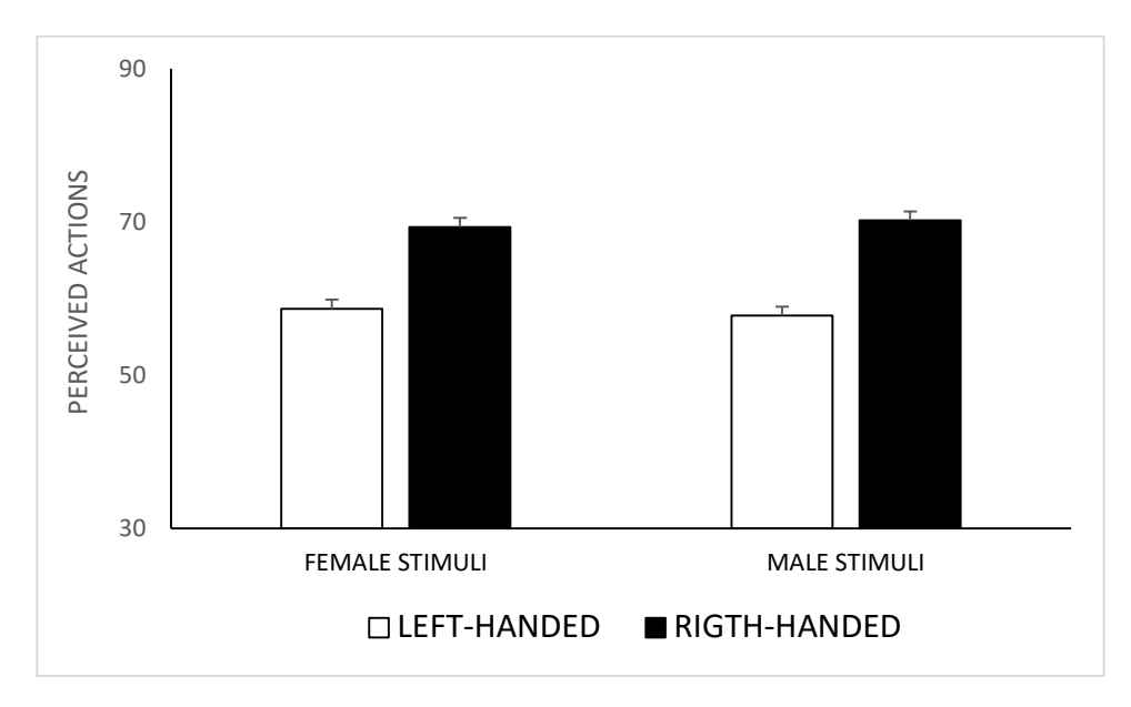
Figure 4. Mean number (and SEM) of actions perceived as right- and left-handed for female and male stimuli.