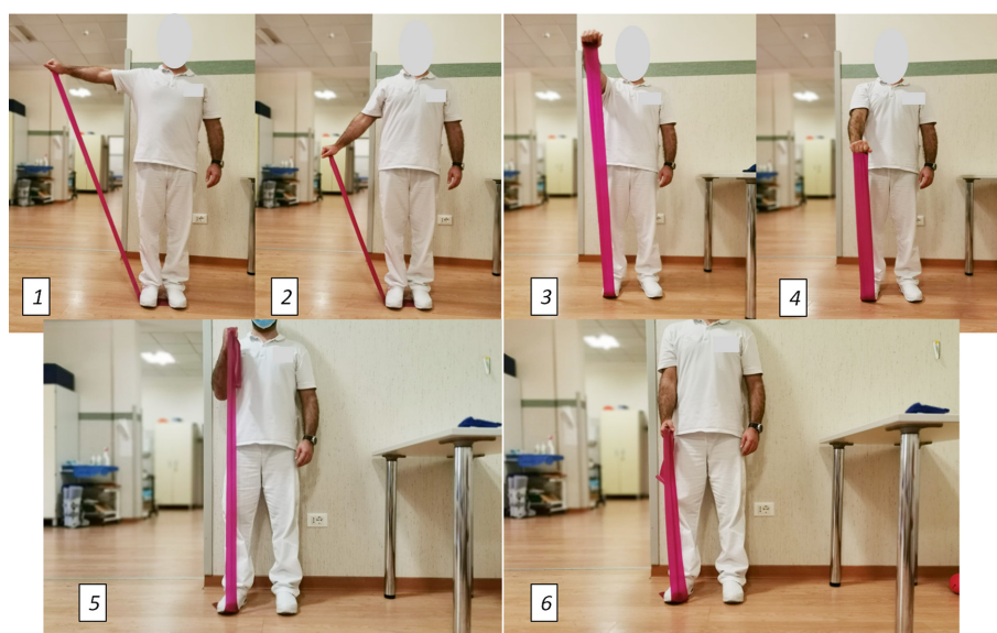
Fig. 1. Home-based exercises for upper limbs.

During the daily home rehabilitative sessions, the patient was instructed by the doctor and physiotherapist to monitor