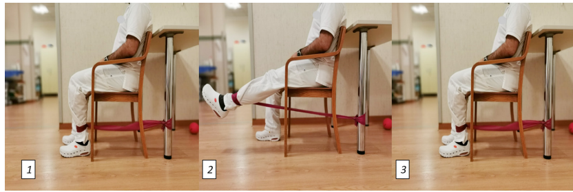
Fig. 2. Home-based exercises for lower limbs.

Exercises to strengthen lower limb muscles (quadriceps, gluteal muscles); 1–3: flexion-extension exercises of the knee (All the exercises illustrated must be performed with shoes with a rubber sole for patient safety).