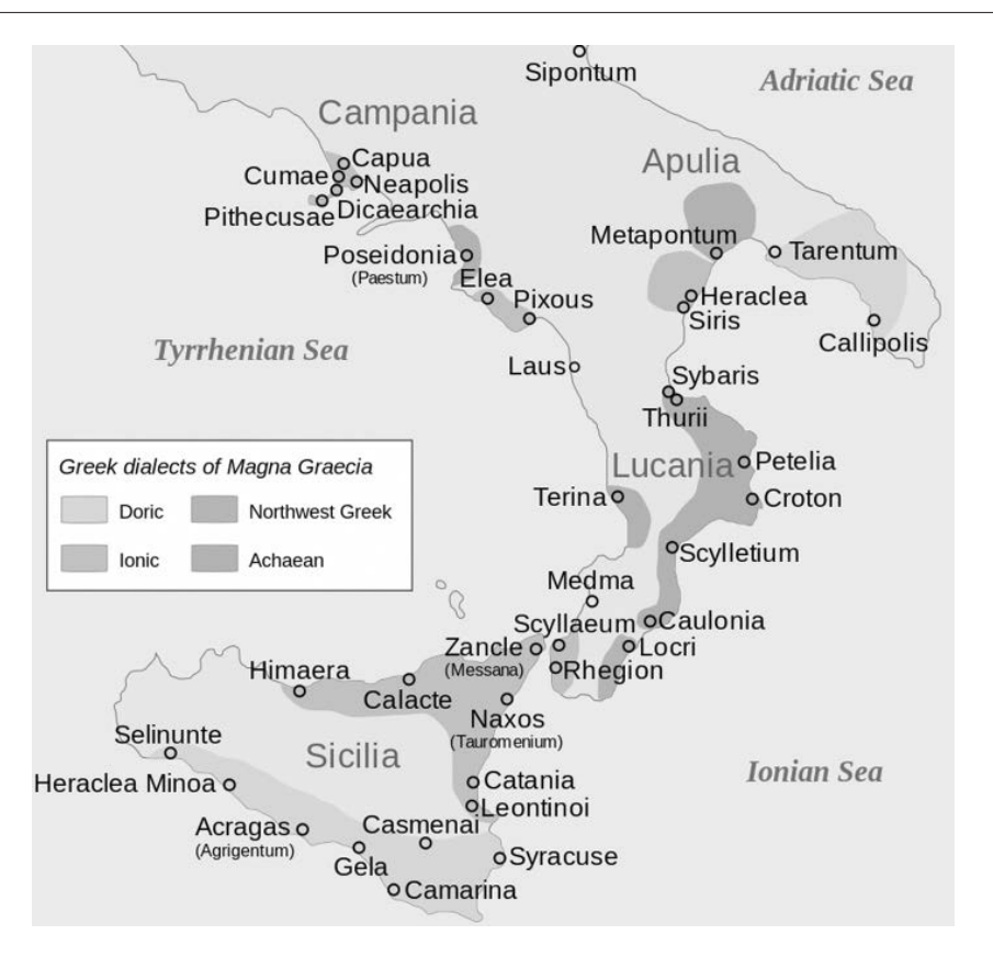
Figure 1: Greek dialects of Magna Graecia