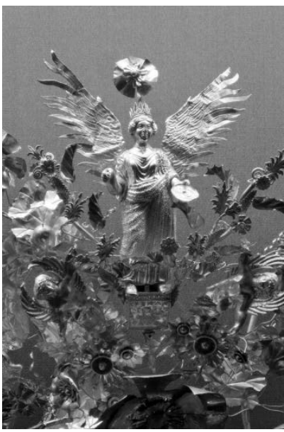
Figures 2 and 3: The gold crown from Armento

I believe that I have already shown<sup>22</sup> that most of the above mentioned interpretation problems depend on the analysis of the text based on the standard Ionic-Attic coeval koine, which prevents the appropriate appreciation of the linguistic features included in the short inscription: first of all, the iotacism revealed by the \langle \varepsilon_1 \rangle \sim \langle \iota \rangle exchange, showing the phonetic match of [e:] and [i(:)]; then, the free oscillation between the graphic signs of eta and epsilon in words show little sensitivity to the vowel quality, although [ \varepsilon :] had not merged into [i(:)] yet. These elements are already clues of a type of Greek that was characterised from a diachronic point of view and are combined with two other significant features: the vowel prosthesis – graphically \langle \varepsilon_1 \rangle , phonetically [i] – in front of the group sC and the omission of the final nasal sound of the article. As regards