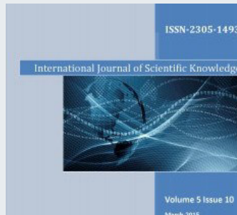
JOURNAL OF TECHNOLOGY