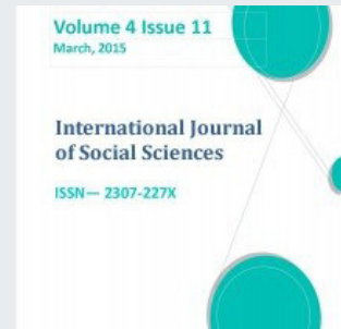
JOURNAL OF SOCIAL SCIENCES