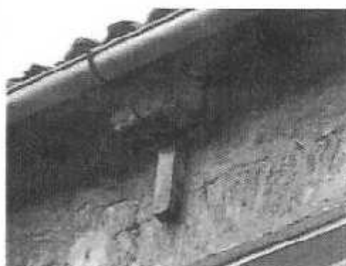
Fig. 6. Montorio al Vomano (Te), Capuchin convent, chain "out" of truss.

It's very difficult, as already noted, to fix a continuity between the art of building and strengthening systems of fabrics. The technical and material continuity that has marked the history of the Abruzzo region avoids any temporal sequence. However, the power and value of tradition had to surrender to a forced renewal in the last decades, perpetrated, as we know, with the use of abuse of the assets as the only alternative to disuse and abandonment. Except in cases, lucky for our study, of non-renewal of the fabrics, predominantly because of abandonment, the same examples that we have in this note are often the residue of the existing processing operations implemented with the latest requirements. These examples, however, in their relationship to a new misunderstanding, make the difference and they indicate a new road to recovery, emancipated from a modernity at all costs, and finally more attentive to the fate of the property than to the verification of the means for its preservation.