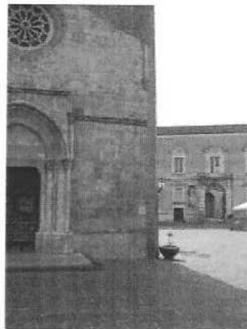
Fig. 2. Vasto (Ch), S. Giuseppe church, façade built with "scarp profile".