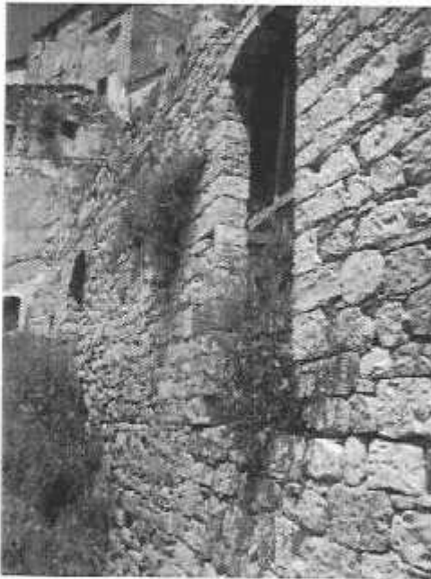
Fig. 1. Castelvechio Calvisio (Aq), "boundary" houses.

Foundation's data are just a few and they can be calculated just in particular case. Starting from the end of 19 th , in absence of scientific criteria on the valuation of the soil's "hardness", these were the least "calculable" parts, especially concerning the size, resolved by experience, common sense and available resources 12 . In a contract in 1537 to build a house "with tower on the top" in Lanciano, was established that walls had to be three "members" high, that is to say three meters and two palms and half wide; instead the tower had to be six floor high and three palms wide from the foundation until the third floor: thickness can be used with two vaults 13 .