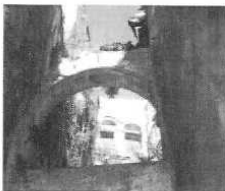
Fig. 5. Navelli (Aq), remains of "soprastrada arches".

Associated with the strengthening of floors and roofs are usually the renewal of the leg support of beams and rafters, extremely vulnerable to the stresses induced by earthquakes, so often undermined by the degradation associated with the stagnant humidity.