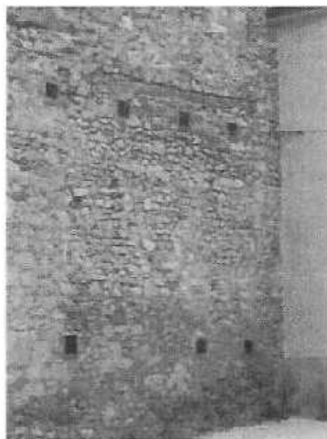
Fig. 4. Resello (Ch), example of masonry with "roots" and iron chains.

In areas of limestone, walls have taken a different shape, linked to the hardness of stone and its corresponding workability, ranging from well-squared masonry, in areas rich in limestone or laminated tuffs, supplemented with mortar of good features that have made unnecessary the use of rescheduling rows 20 .