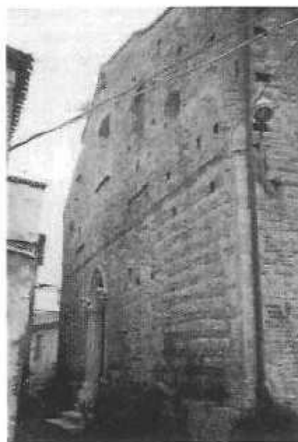
Fig. 3. Castelbasso (Te), example of mixed masonry.

One possible way to solve the lack of good binders and to ensure the building of walls in the best way, is the accustoming, especially in the province of Teramo from the first centuries after the Year One Thousand, to mix them with stones and bricks (Fig. 3), alternated with interstices of various thickness according to the size changing time to time in favour of the later. The numerous examples of civil and religious architecture that use this constructive reason for texturing walls and arches framing, confirm a research entrusted not only to the aesthetic effects resulting from dichromate of materials, but also to the effectiveness of bricks capable to act in cushioning the efforts and levelling of stones not always smooth. Of course the best examples, especially in terms of stability, are when the bricks have regular alternation of cutting head and, acting as a belt, all the more urgent as the number of interstices 19 .