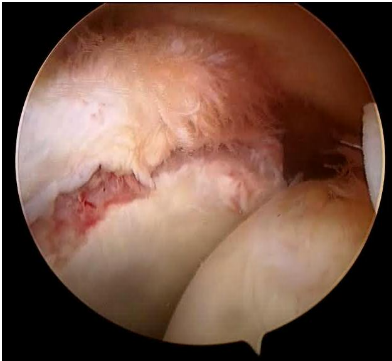
Figure 1. Arthroscopic assessment of the lesions.

Mean duration of surgical operation was 1 hour and a half for open surgery, and 1 hour for arthroscopic repair. Mean Rowe score was 90 in the open surgery group, and 95 in the arthroscopic repair group. Based