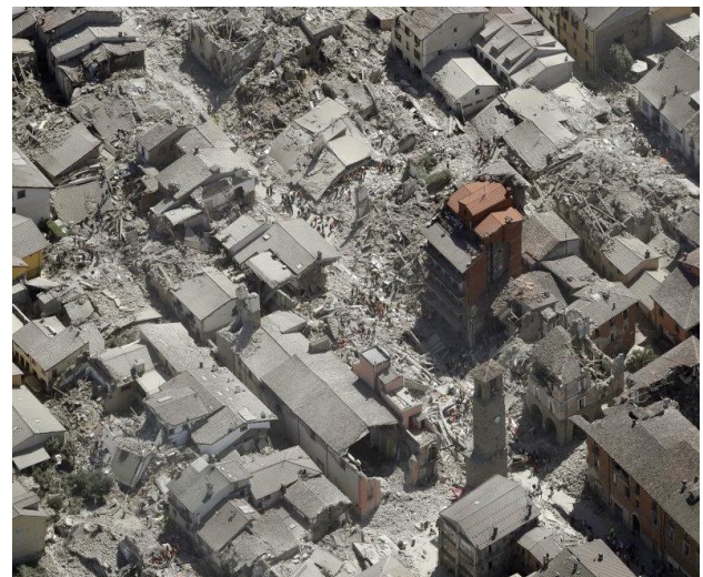
Figure 3. Amatrice (Rieti) after 2016 earthquake.

The practice of restoration must consider this approach; in contrast to “a conservative outlook on preservation, we must adopt a vision of active memory, of imaginative memory” (Cacciari, 2000, p. 13).