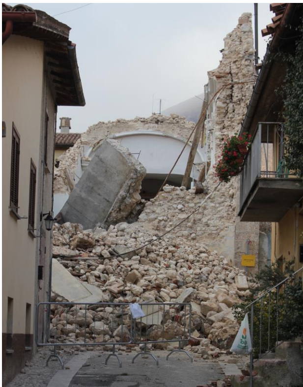
Figure 4. Norcia (Perugia). The collapse of the Crucifix church.

In June of 1981, shortly after the seismic event that did noteworthy damage to the Irpinia region on 23 November 1980, and two years following the earthquake that struck Valnerina in September of 1979, Tomas Maldonado, editor of the ‘Casabella’ magazine, wrote an editorial entitled Terremoto, quale ricostruzione (The Earthquake, How to Rebuild) . The author did not use a question mark, as if to emphasise the eminently technical capacity to manage the reconstruction process, though this aptitude, at least in the practical sphere, has yet to manifest itself, leading instead, in the intervening years, to in-depth critical reflections. Apart from obviously indispensable emergency work to resolve the housing problems of the moment and to ensure the safety of the damaged portions of the historical architectural heritage, discussions of reconstruction should be held within the framework of a cultural policy geared towards addressing seismic risk and the resulting strategies, with the ultimate goal of safeguarding the historic-architectonic heritage, though naturally without neglecting the all-important tie between defence of the historical heritage and the upgrading of urban centres to reflect the changed (and still changing) living conditions of today’s multifaceted society.