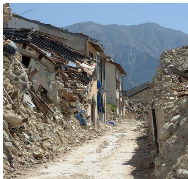
Figure 5. Amatrice. The historic center after the earthquake.

There is no question, therefore, that any restoration project must be approached on a number of different levels: individual buildings, the urban settlement as a whole, the countryside; while the plans for the reconstruction of historic urban cores should be inspired by an historic-evolutionary analysis of the town, focussing on determining the processes that led to the formation of the urban fabric and its constructions while studying their effect on the material components of constructed elements, in order to prevent damage from seismic events. And so the goal is to see to it that historical knowledge of the mechanisms of a town’s development plays an increasingly active role in preservation efforts.