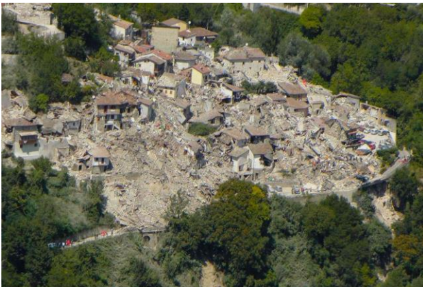
Figure 2. Accumoli (Ascoli Piceno) after 2016 earthquake.

The development of what are known as the ‘rules of craftsmanship’ is nothing more than the gradual refinement over time, through the construction of historic buildings, of the working criteria and principles of geometric proportion for the constructions: criteria and principles that, depending on the materials available, combined to form construction techniques which included specific local features.