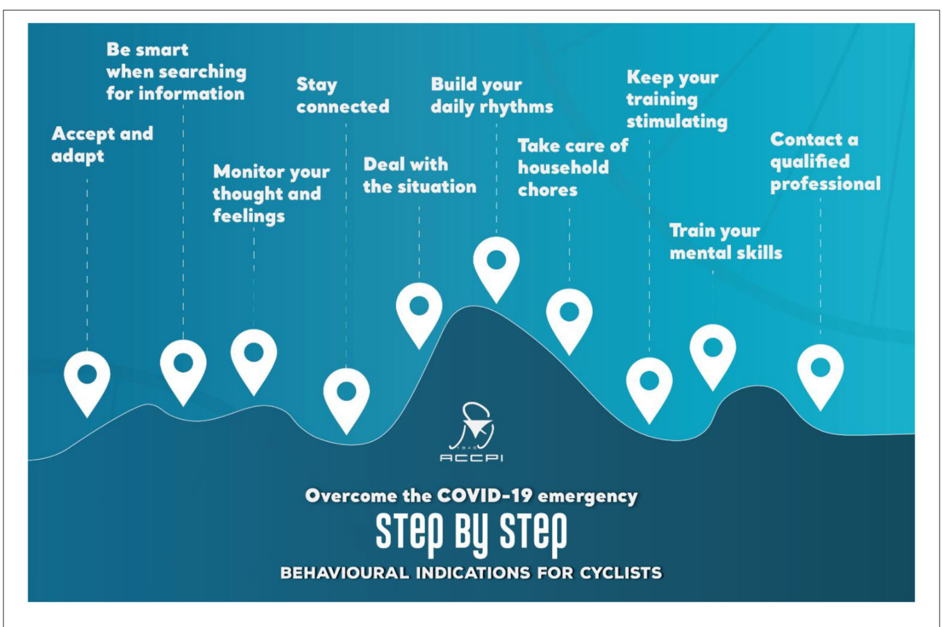
FIGURE 2 | Infographic: Decalogue of behavioral indications for cyclists.

After a theoretical introduction, a practical session on relaxation (Autogenic Training; Shulz and Luthe, 1969) and mindfulness (Kabat-Zinn, 1982, 1990; Birrer et al., 2012) was presented to the participating athletes.