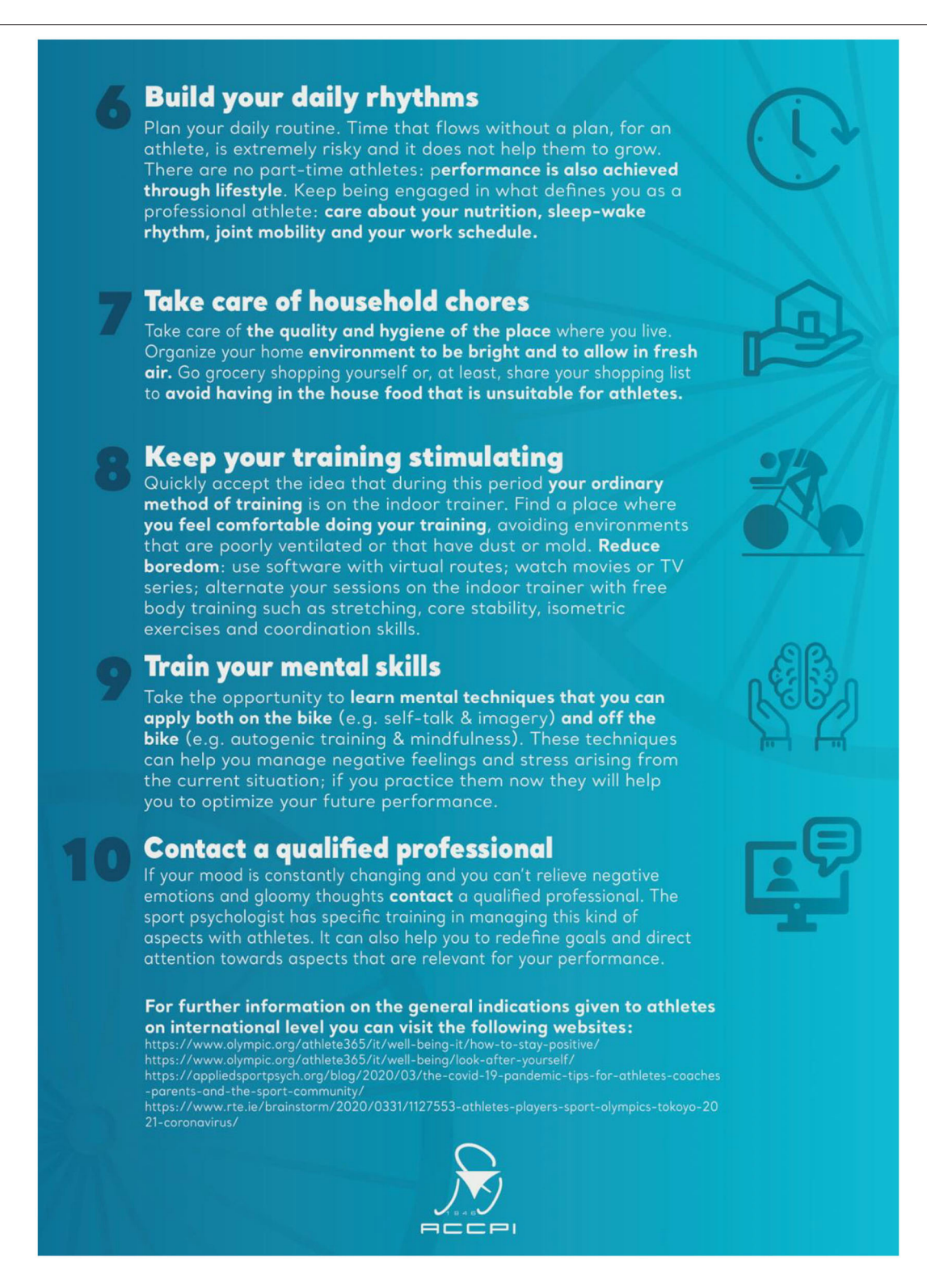
FIGURE 3 | Decalogue of behavioral indications for cyclists.