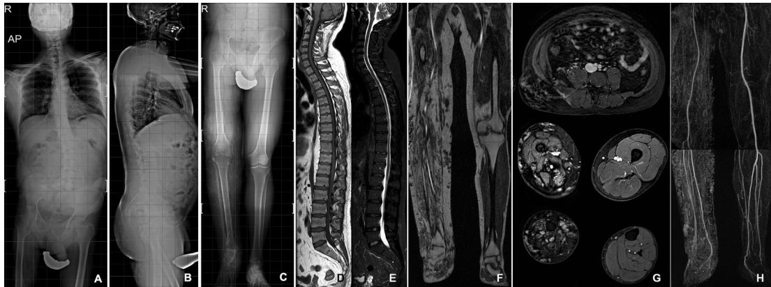
Fig. 1. (A) Standing anteroposterior and (B) lateral radiographs. (C) Radiography shows limb length discrepancy (LLD), right coxa valga and periosteal and endosteal scalloping of the right femur, tibia and fibula. Soft tissue hypertrophy of the right lower limb associated to multiple vascular calcifications are detected. (D, E) T1 and T2+FS without contrast in sagittal views: spinal disc herniation or Chiari-I malformation are not documented. (F) T1 and (G) T1+FS with contrast in coronal and axial views, respectively, well depict the right lower limb hypertrophy, the fatty replacement of all muscles, subcutaneous and intermuscular lesions from gluteal region to the foot representing diffuse soft tissue hemangiomas. (H) Contrast-enhanced MRA three-dimensional reconstructed maximum intensity projection shows normal arterial course bilaterally

associated to severe hypertrophy of the leg. Past surgical history revealed tibio-tarsal arthrodesis in 1993, and multiple vascular malformations excisions. Radiographies showed skeletal KTS manifestations (Fig. 1). MRI of the spine not documented Chiari-I malformation. The study was completed by Magnetic Resonance Angiography (MRA) of the lower extremity which demonstrated multiple, irregular, prematurely contrast-enhanced venous varicosities both in the superficial and deep venous system, from the gluteal region to the foot. A significant unilateral lower limb hypertrophy with fatty muscle degeneration was evidenced (Fig. 1). Conservative treatment was advised, consisting in elastic compression stockings, shoe lift and pain medications as needed.