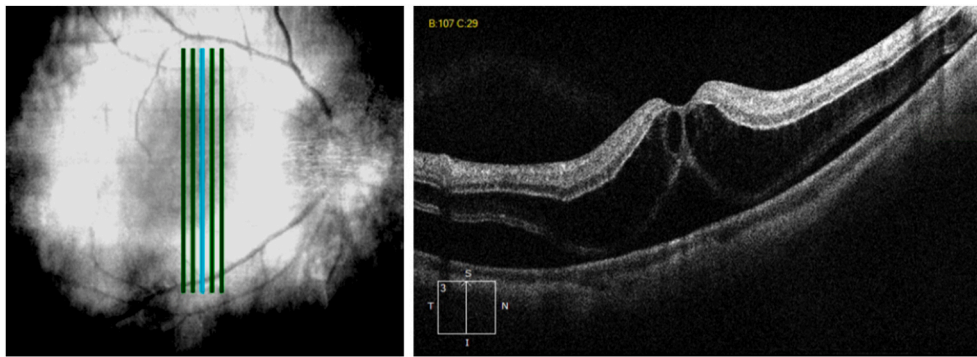
Fig. 2. Macular OCT at 24h after cataract surgery showing macular thickening with intraretinal and subretinal fluid.